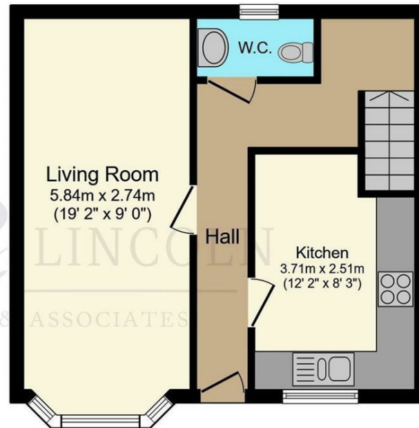
Ground Floor Floor area 36.6 m 2 (394 sq.ft.)